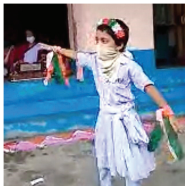
Independence Day celebrations at Rotary Chowrenghee Vidyalay